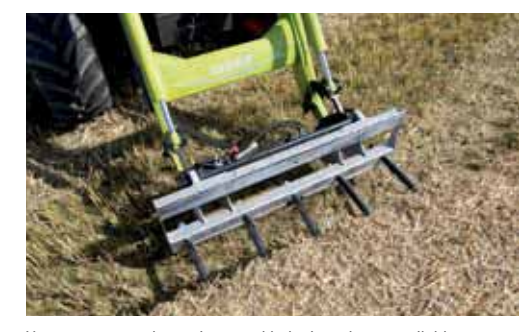
Very easy setup when using round bale tines due to available taper bushings (screw-on). With more or fewer tines depending on use.