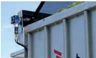
Hydraulically driven oil motor for pulling in the covering net