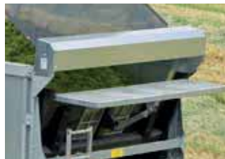
Protective device against dirt and damage