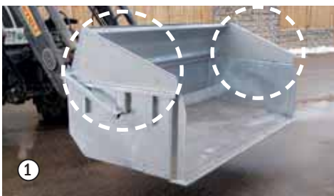
Triangle peaks (retrofit kit)