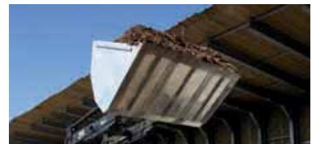
Fastened onto front loader with Euronorm quick exchange system