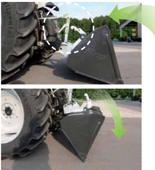
Three-point adapter rigid

The special feature of the three-point rear adapter from Fliegl is its latch mechanism, which can be used for tipping, unloading and setting down loads and transported material without difficulty. This eliminates inconvenient manual work. The Fliegl tipping mechanism can be triggered simply by cable pull with the rear hydraulics lowered. Lowering engages the mechanism again and the attachment is then once again securely connected with the tractor.