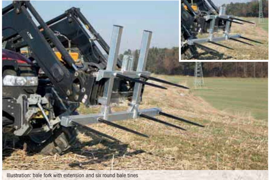
Illustration: bale fork with extension and six round bale tines

For attachment to Euronorm mounting and three-point hitch