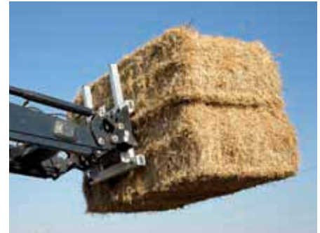
Illustration: bale fork with four round bale tines, with extension