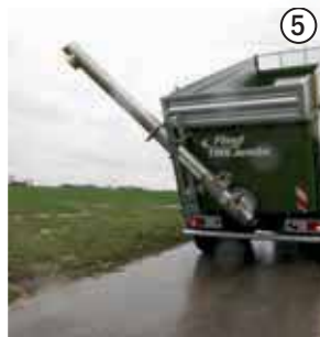
Ø 254 mm version, folded together.