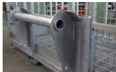
Illustration with welded Manitou mounting