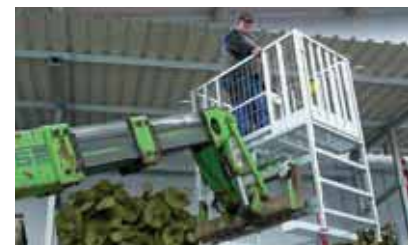
Illustration with Merlo mounting